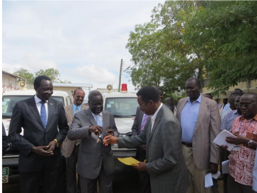
UNFPA Country Representative hands over the keys of two ambulances to the Ministry of Health.

remain early marriage and intercourse; pregnant women under 19 years old represent 17% of clients recorded for the first visit in ANC services.