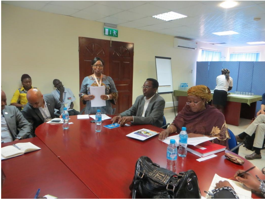
SRSZ Zainab Bangura discusses GBV issues in South Sudan at the GBV Subcluster meeting held in Juba.