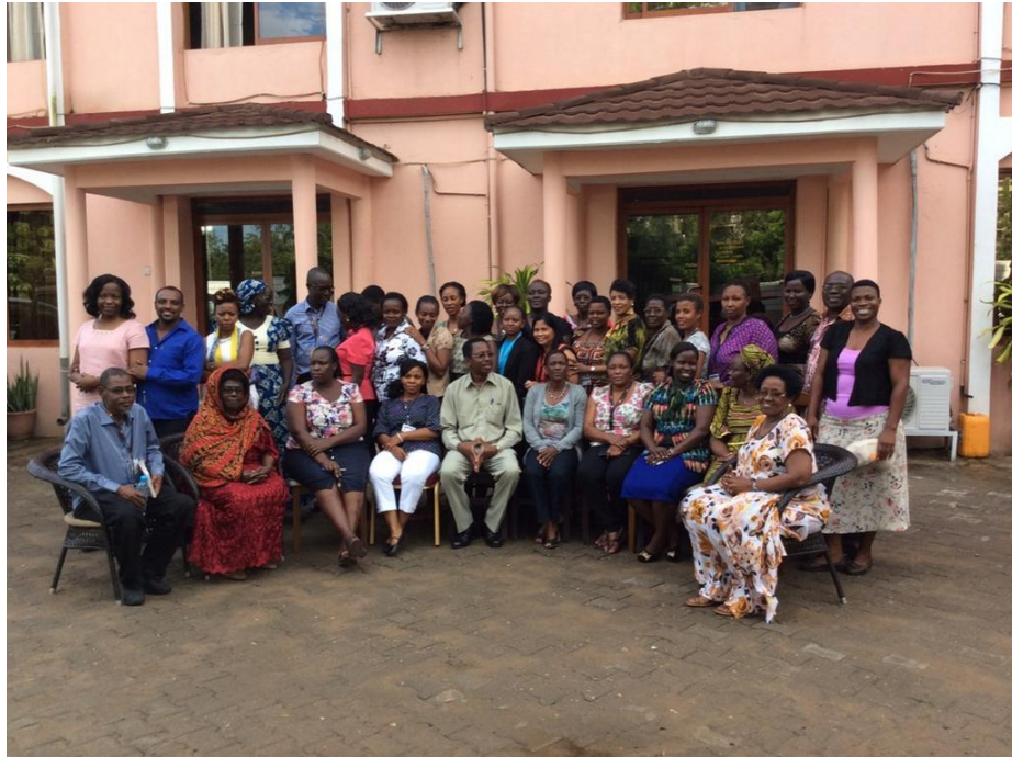
IUNV Midwives gathered in Juba this past week for a two day workshop focused on GBV issues.