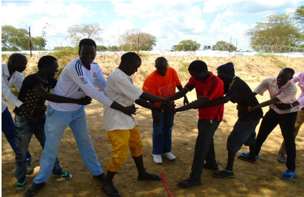
Youth participate in team building exercises during a UNFPA supported training in Bor.

Cumulatively, using selected core indicators, the status since 15 December 2013 is as summarized in Figure 2