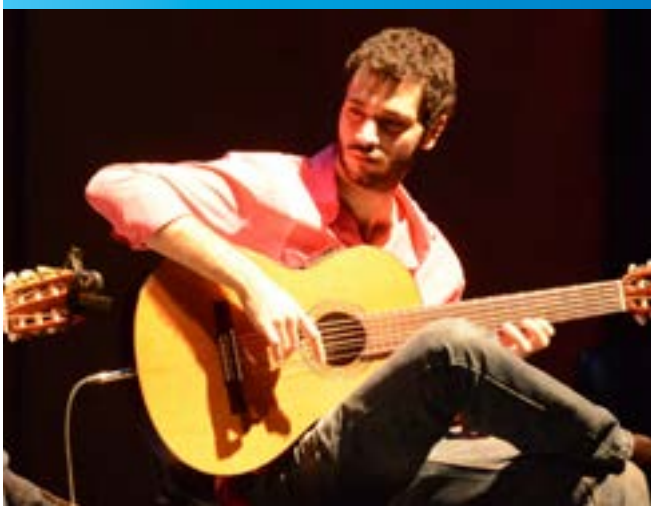
A Syrian youth plays guitar on the World Humanitarian Day 2015