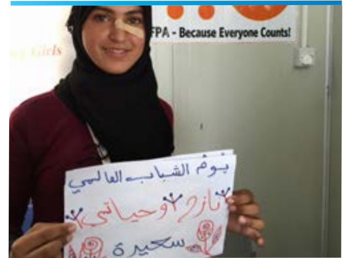
A girl holding a sign that reads, "International Youth Day ... internal displaced person and happy", in Arbat camp, Iraq