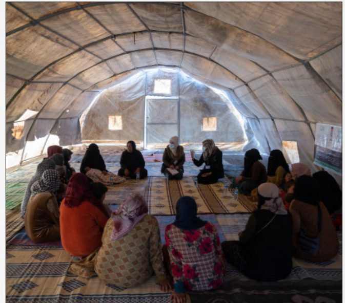
Women and girls are supported by UNFPA's partner, Ihsan, at a session to assess and support women's needs following the earthquakes that affected the region.

which are critical to sustain operations of 182 health facilities.