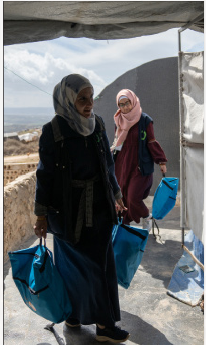
In Sheikh Bahr camp near the town of Armanaz, in the countryside of Idlib, our partner Ihsan in providing women and girls with dignity kits. They include hygiene products for menstruation; cleaning and laundry; warm clothes and blankets; and other items to meet immediate needs.

UNFPA has published this video to highlight the dire needs on the ground and its efforts to ensure no one is left behind. A feature story was also published to mark the passing of 12 years since the onset of the protracted crisis in Syria.