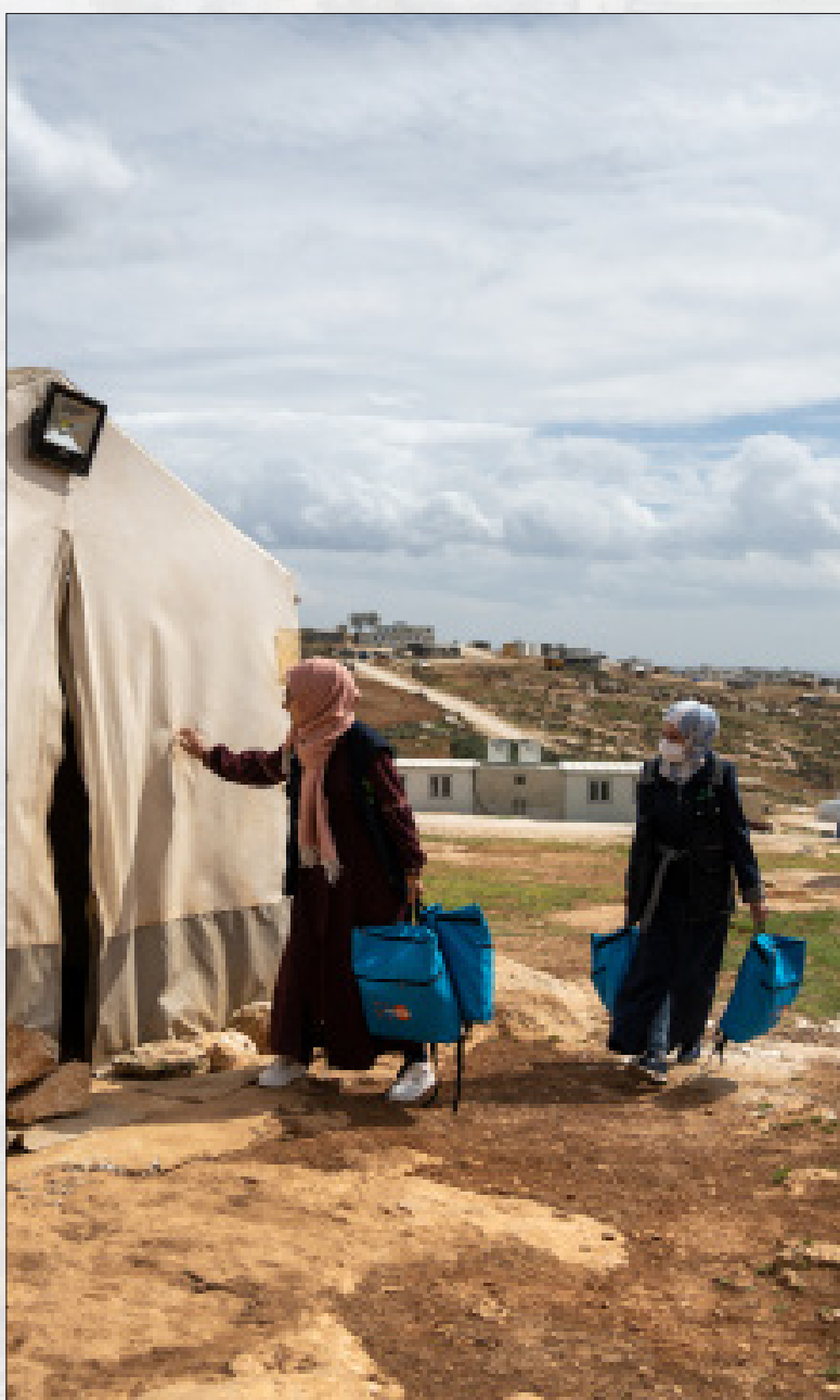
In Sheikh Bahr camp near the town of Armanaz, in the countryside of Idlib, our partner Ihsan is providing women and girls with dignity kits. They include hygiene products for menstruation; cleaning and laundry; warm clothes and blankets; and other items to meet immediate needs.

Damaged health care facilities resulted in a lack of essential lifesaving obstetric and neonatal care services. Increased referral times to functioning hospitals and reduced capacity of trained providers has impacted access to care for both normal and urgent deliveries. This has increased the risks of otherwise preventable maternal morbidity and mortality. Access to comprehensive reproductive health services including family planning has been disrupted which is contributing to increased morbidity and mortality, as well as psychological and mental health distress.