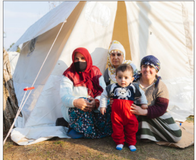
UNFPA and local partners are providing support to women and girls in a temporary camp in Diyarbakır, which has been set up following the earthquakes.

Life-saving reproductive health commodities: UNFPA works to ensure that SRH services and supplies are accessible in service delivery units and carefully monitors their stocks to guarantee uninterrupted delivery of services. Almost 2,000 reproductive health supplies have been provided to affected communities since the onset of the crisis. The first part of a shipment of Inter-Agency Emergency Reproductive Health Kits shipment is under customs clearance.