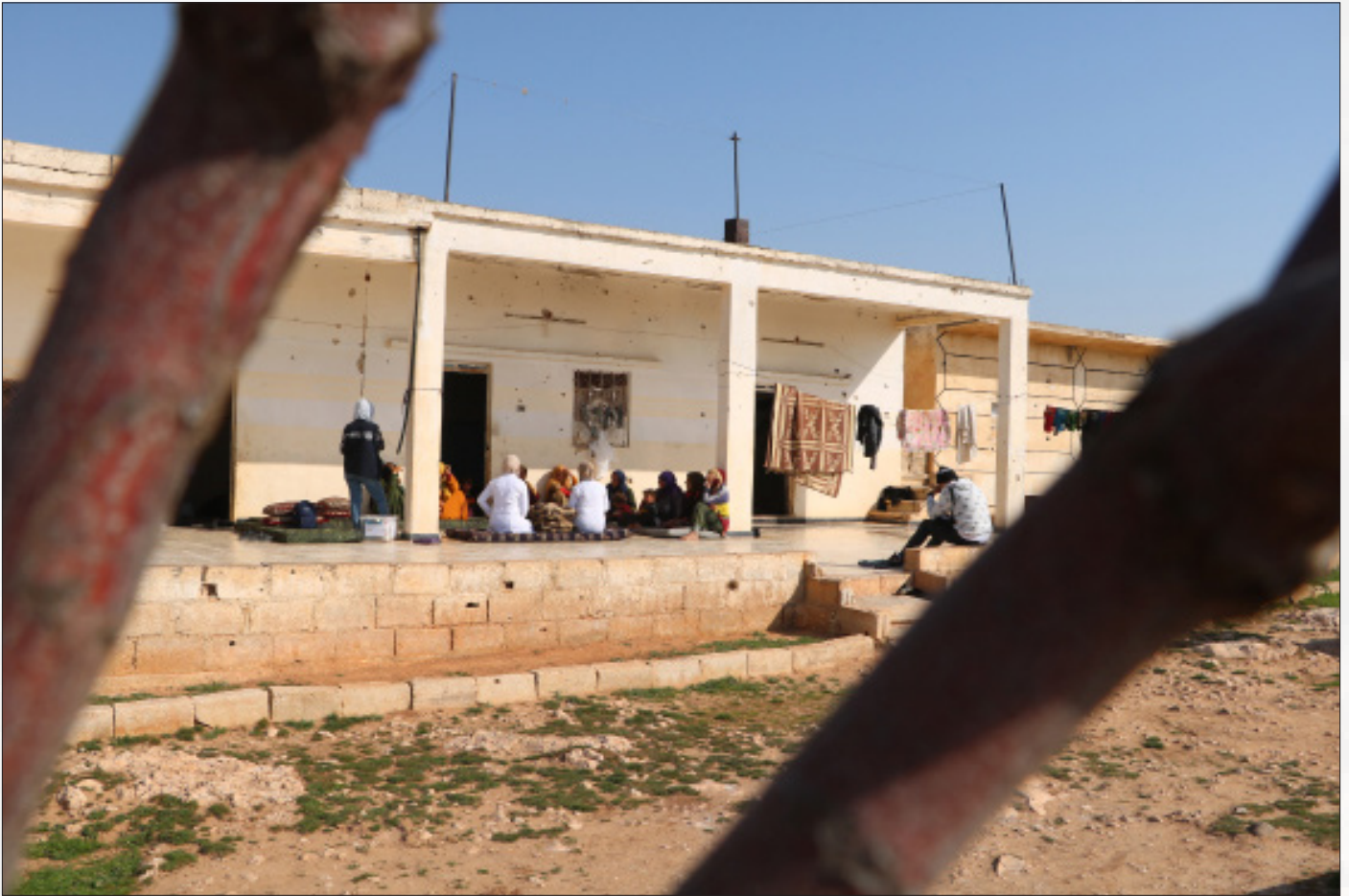
In Idlib in north-west Syria, two mobile medical teams have been deployed by UNFPA's partner, the Syria Family Planning Association (SFPA). Here, in the village of Mazra'at Al Zahraa, the teams are providing reproductive health consultations, pregnancy check-ups, psychological first aid (PFA), psycho-social support, Gender-Based Violence interventions, as well as the distribution of dignity and hygiene kits.