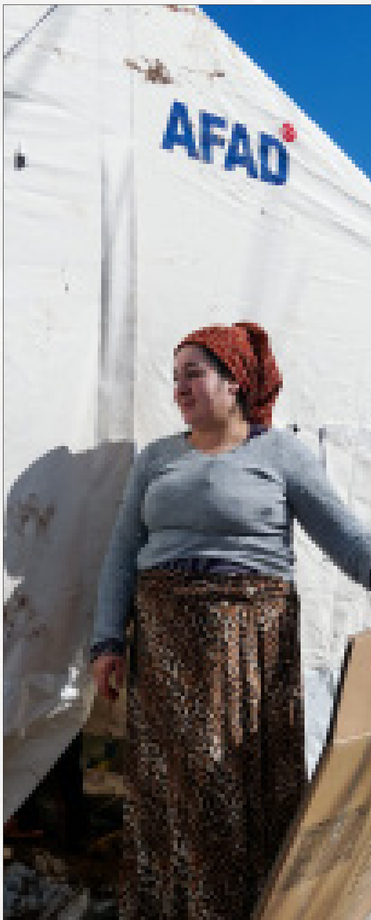
A woman who has been displaced by the earthquake standing outside a tent in a temporary displacement camp in Diyarbakır. She says that when she and her family fled they were unable to take any of their possessions. The day before, UNFPA provided her with a dignity kit, the contents of which she says are very useful.