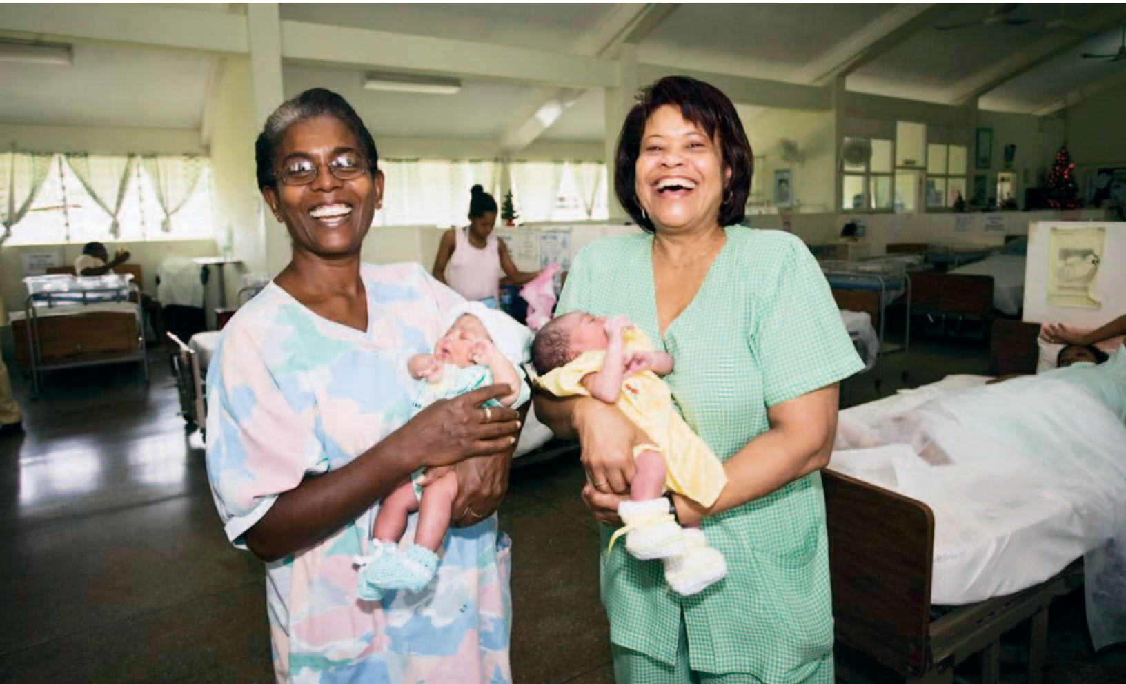
Sangrend maternity hospital, Port of Spain, Trinidad.

During national discussions about maternal health policies and strategies, the programme's Country Midwife Advisors will serve as strong advocates for the midwifery profession and its potential impact on reducing maternal mortality. The year 2010 will be decisive in this respect, with major advocacy events and further expansion of the programme planned in the Africa and Asia regions.