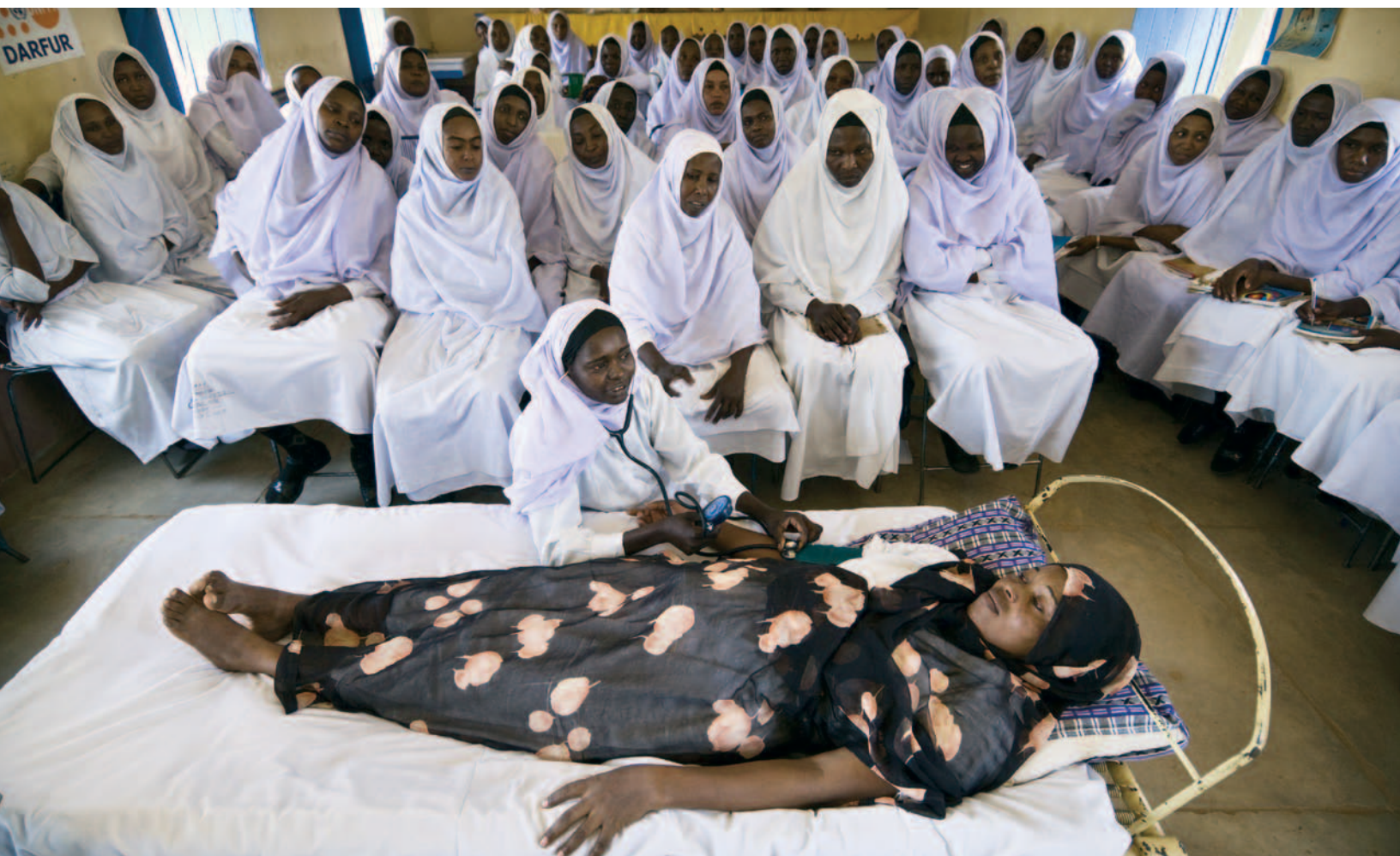
Students at the UNFPA-supported Midwifery School of El Fasher examining a pregnant woman. El Fasher, Darfur, Sudan. June 2007.