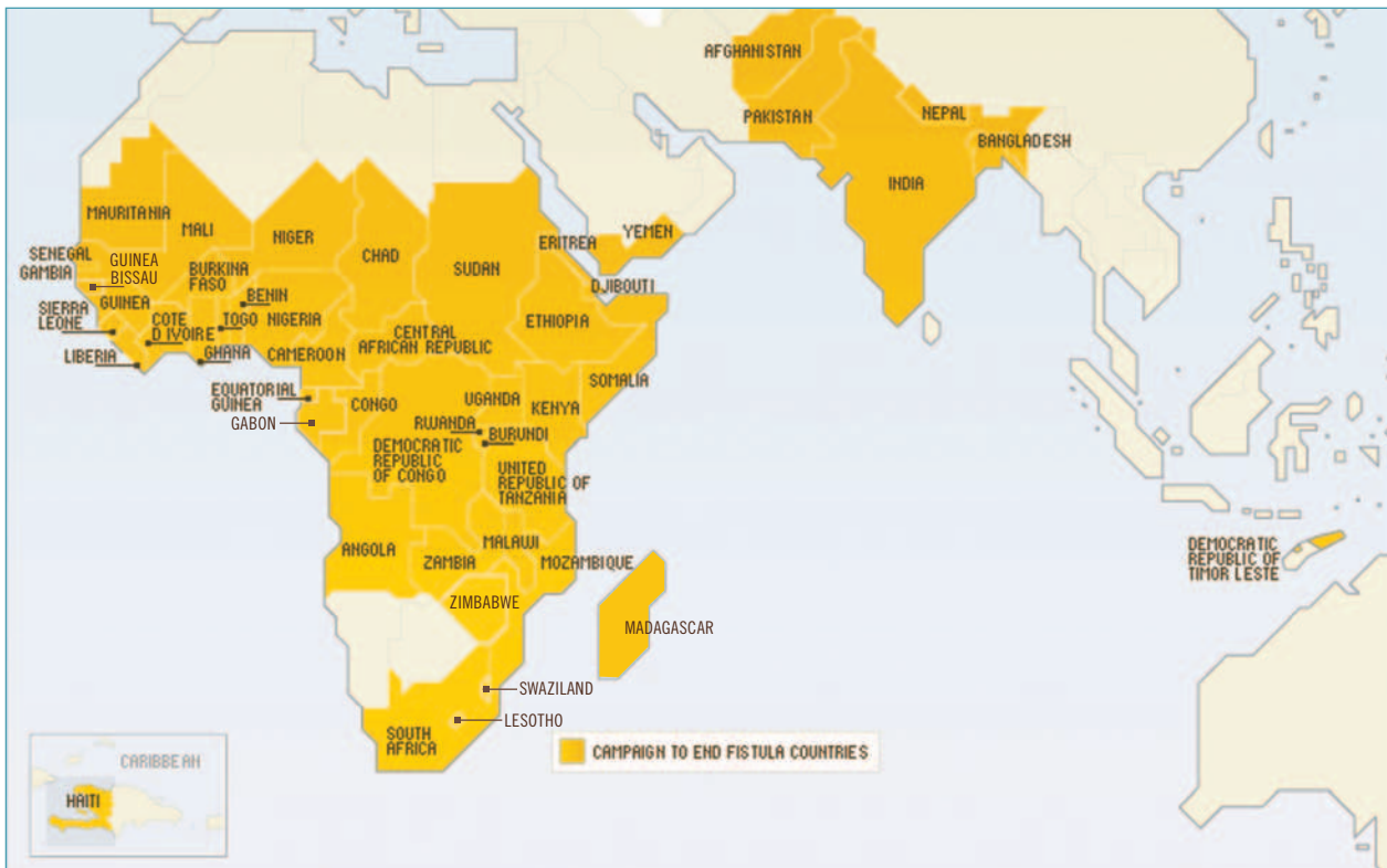
Figure 1: Campaign Map

Within six years, the campaign has quadrupled in size, spreading from its original 12 countries to include 49 countries in Africa, Asia and the Arab States. As a result of this growth, more and more women are able to access the care they need to prevent and treat fistula and return to full and productive lives after receiving fistula treatment with the support of UNFPA, governments and partners.