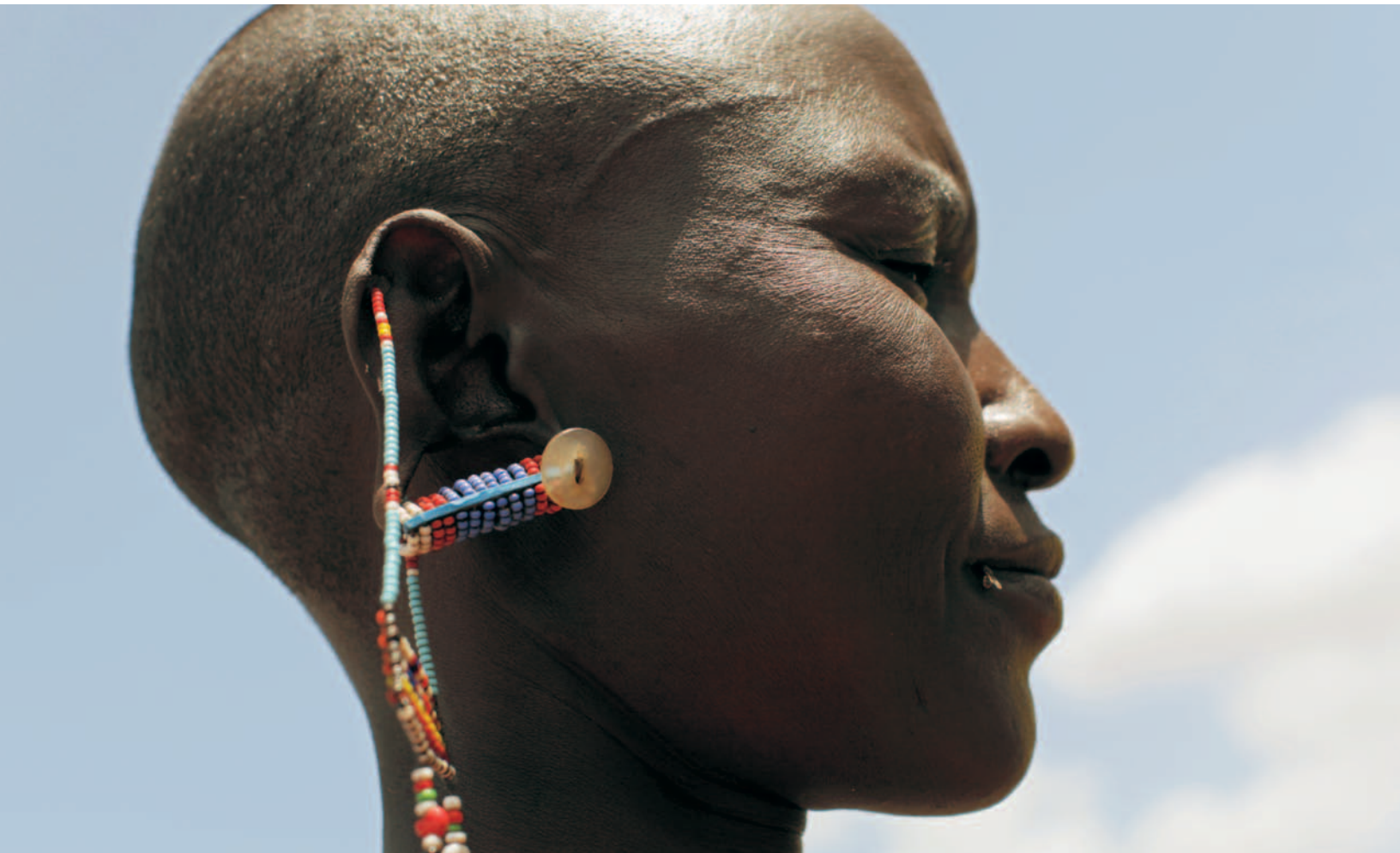
A Masai woman in the Rift Valley province, Kenya.