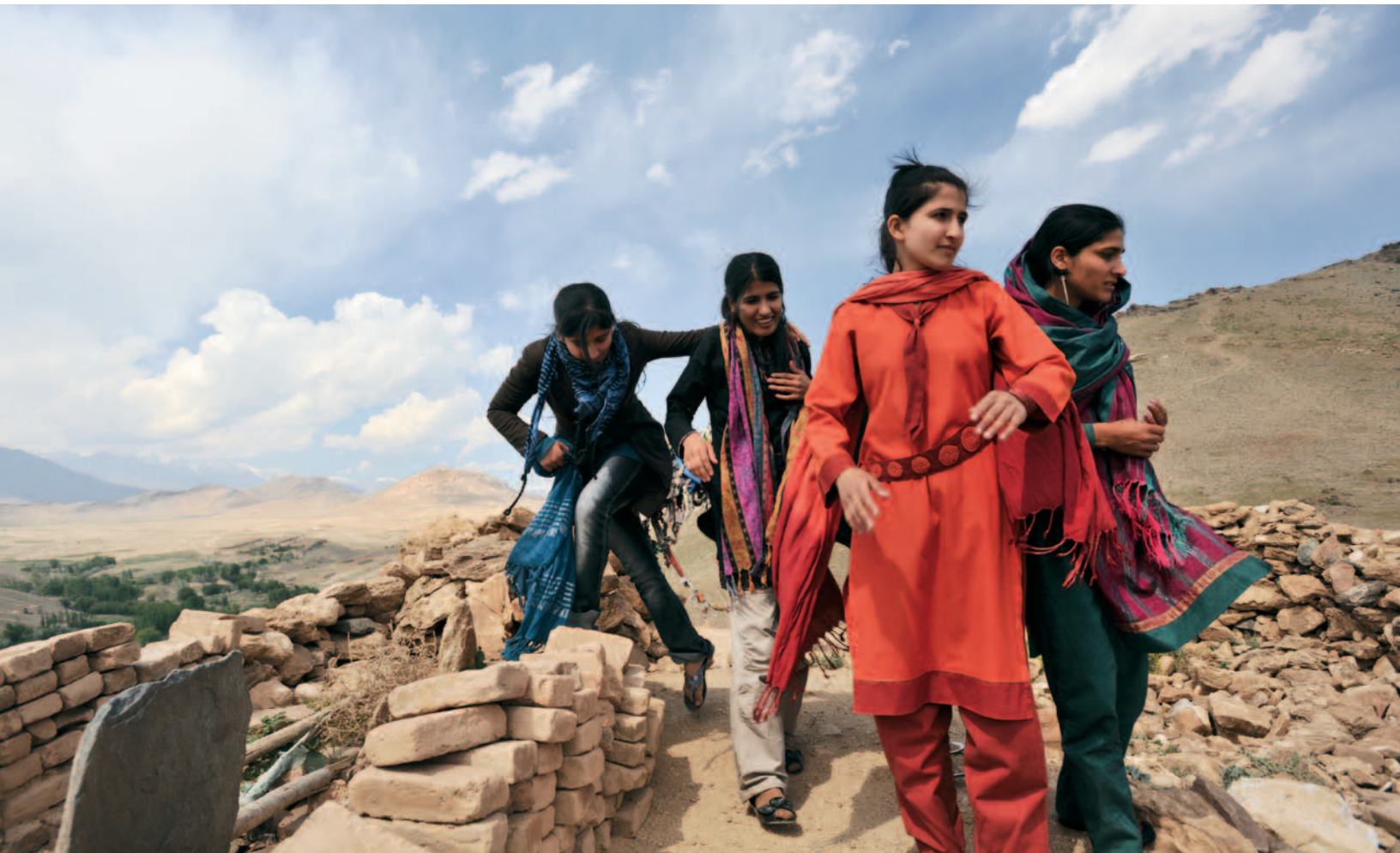
Young girls in Afghanistan.