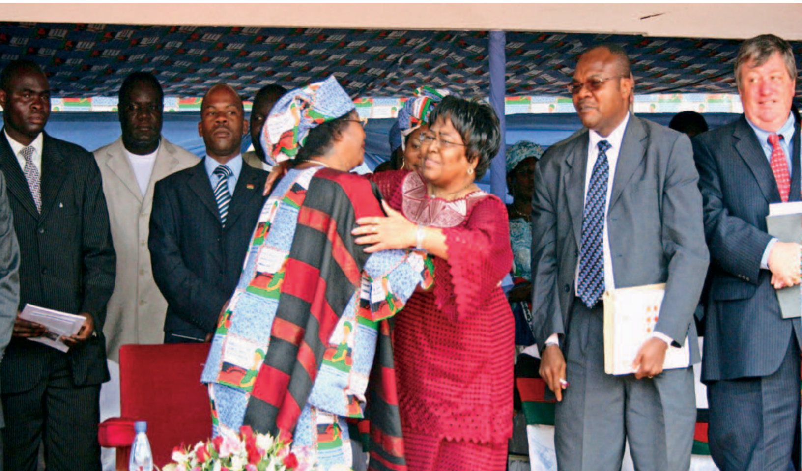
Scene from inauguration of the Campaign on Accelerated Reduction of Maternal Mortality in Africa (CARMMA) in Malawi.