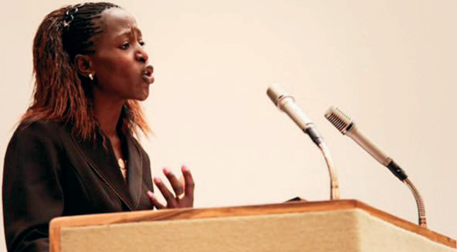
Fistula survivor and activist Sarah Omega joined singer, actress and campaign celebrity spokesperson, Natalie Imbruglia, to call for action on maternal health and obstetric fistula. Economic and Social Council (ECOSOC) meeting of the United Nations, July 2009.