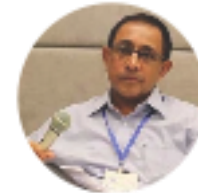
Hon. Kabir Hashim Chair Global Parliamentarians Forum for Evaluation